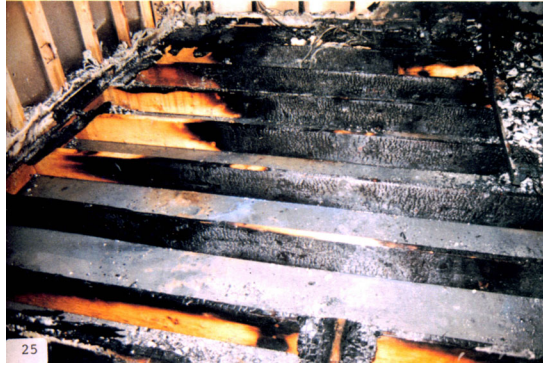
Figure 7 Floor burn-through in USFA test initiated by pouring gasoline on floor; ample ventilation (Test #4)

Much higher charring rates apply to floors and to any other wood members where charring is affected by the presence of gaps or joints. Laboratory tests show a typical charring rate for floorboards of 1.5 mm/min, but under many conditions the values are much larger. Even small gaps between boards, if