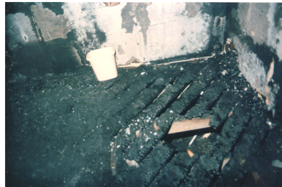
Figure 2 Floor burn-through in a Santa Ana Fire Dept. fire test; no liquids were used