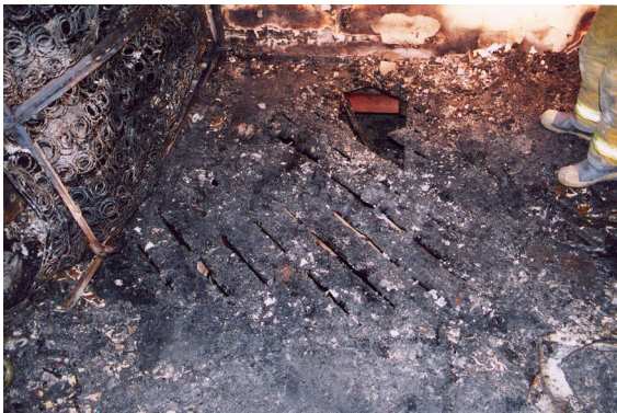
Figure 1 Hole burned through hardwood floor and subfloor underneath a mattress fire

The burn patterns of most interest to investigators are often those on the floor. The laboratory studies examined above indicate that significantly greater charring rates should be expected for floors, even under ‘ideal’ conditions, i.e., no unprotected joints or gaps. But real wood floors will likely have unprotected joints or gaps. In addition, the floor is often in a position where a strong in-draft takes place, due to air being pulled into the fire from an open window or door. Under such conditions, it does not take a long time (nor use of any liquids!) to burn up floorboards. Figure 1 shows the aftermath of an accidental fire where the victim unintentionally set her bed on fire with a cigarette. The only areas of severe floor damage are those directly underneath the mattress. Hardwood flooring is completely gone, as is a piece of the subfloor consisting of 25×150 mm (1"×6") rough-sawn planks, laid diagonally. Typically, a polyurethane foam mattress will burn up in 5 min or less, so the time available to cause this damage was quite limited. If the fire exposure time is taken as 5 min, then the charring rate was roughly 7.6 mm/min in this fire.