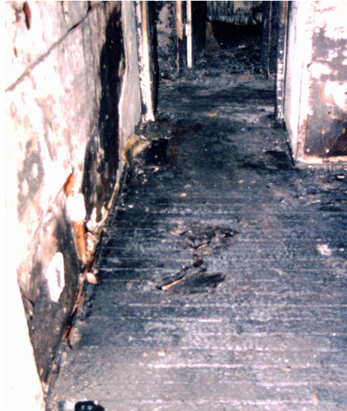
Figure 3 Floor burn-through in another Santa Ana Fire Dept. fire test; no liquids were used

Figure 2 shows the burn-through damage seen after a test conducted by the Santa Ana Fire Dept. where an actual, full-scale furnished house was burned. A summary of these tests is given in a report by Walton et al. [44], and the test is identified as being at 1309 S. Bristol Street. The burn-through location was near the ignition source, which was a plastic wastebasket; an unburned exemplar is shown in the photo. The subfloor comprised 25×150 mm (1"×6") rough-sawn Douglas fir planks, laid diagonally. On top of this were oak floorboards, approximately 12.7×31 mm (1/2"×1.25") size, laid horizontally. Residues of the oak floorboards are not visible in the photo since these boards completely burned up. The subfloor planks were charred fully through and substantial charring had also penetrated into the wood joists supporting the floor. Total burn time was 23.7 minutes, but peak temperatures were only around 600°C and for only a duration of about 16.1 minutes was 200°C exceeded at the ceiling level. If 15 min is taken as the fire duration, then the effective charring rate would be 2.5 mm/min, however, even 15 min is likely too high an estimate of effective fire duration and, in addition, the time was more than enough to fully char through the floor. Thus, a better estimate may be 3.5 mm/min.