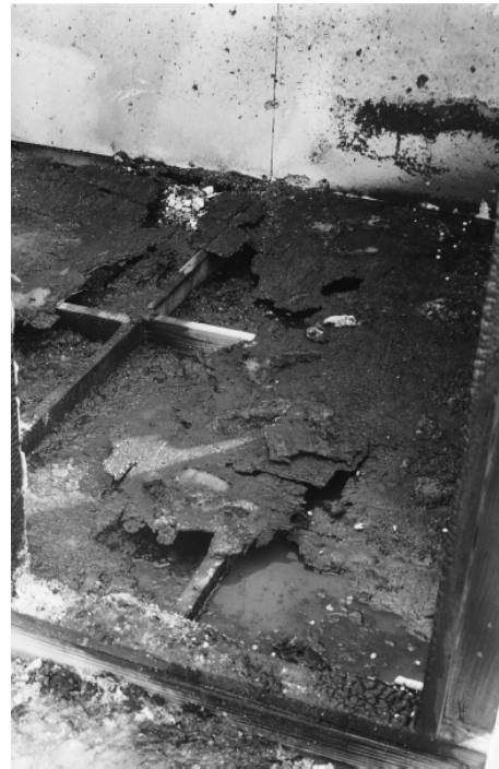
Figure 4 Burn-through of carpet and 12.7 mm plywood floor in a room fire test involving no liquids and less than 4 min of post-flashover burning

Figure 3 shows the burn pattern in another similar test (1247 S. Bristol Street) conducted by the Santa Ana Fire Department. Albers discussed this fire test [45], pointing out that fire investigators tended to consider the pattern to be the consequence of a flammable liquid pour, even though no liquids were used and this particular room was actually unfurnished. The deep burns were a consequence of the fact that this area formed the ventilation path for the fire, with an open door being located about 1 m away. In the same test, another area of the floor showed extremely deep burns despite, again, being a place where no movable fuel load was present. Those burns, while more extensive, did not mimic the outlines of a pour pattern, however. The latter area was also in a location which was subject to the draft of the incoming air. The total fire duration in this test was 20.2 min, but it was observed that the floor did not ignite in the area where the burn-through is shown until 9.8 min into the test. Thus, active charring lasted only about 10.4 min; on this basis, a charring rate of 3.7 mm/min can be estimated. In the same test series, it was noted [46] that, in the case of a very rapidly developing fire, floorboards buckled early in the fire. Once this occurs, penetration of fire along the sides will become significant.