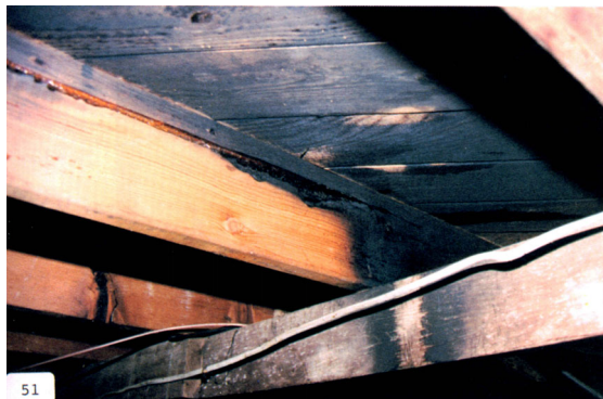
Figure 8 Floor burn-through in USFA test initiated by pouring gasoline on floor; limited ventilation (Test #6)